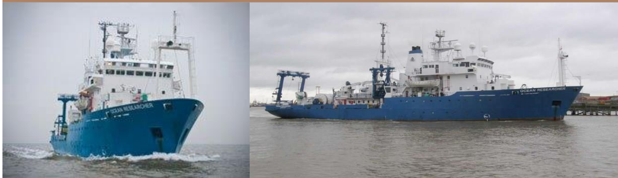
RV Ocean Researcher