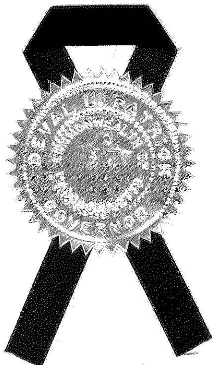
WILLIAM FRANCIS GALVIN SECRETARY OF THE COMMONWEALTH

God Save the Commonwealth of Massachusetts